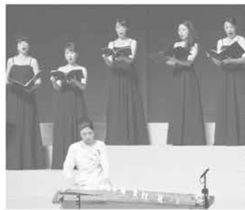
International Choral Bulletin